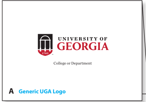
A Generic UGA Logo