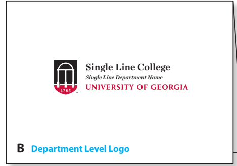
B Department Level Logo

* Provide Dept Logo as .eps along with order form.