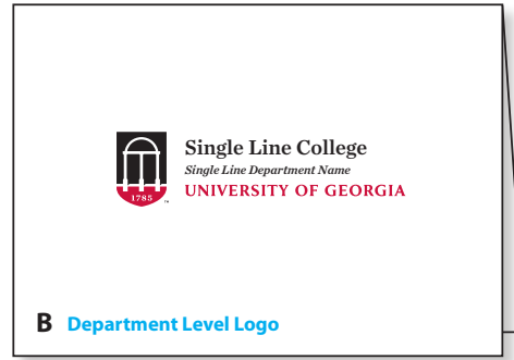
B Department Level Logo * Provide Dept Logo as .eps along with order form.